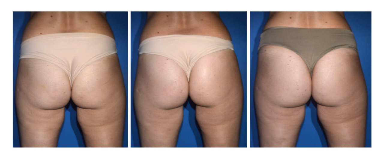
Figure 3: Photographs of a 25-year-old female (Subject ID 7) taken at baseline (left), after the 4th treatment (middle) and after 3 months (right).

photos is lifted, firmer and gives the impression of fuller look. In addition, a slight volumetric enhancement can be seen in the 3-month photograph.