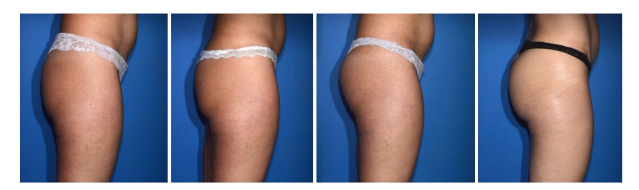
Figure 1: Digital photographs of subject ID 6 taken at baseline (left), after the 4th treatment (middle left), during the one-month follow-up (middle right) and three-month follow-up (right). The photographs illustrate gradual progress in the shape of the buttocks.